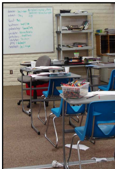
Far Right: A quick glimpse at one student's class project.