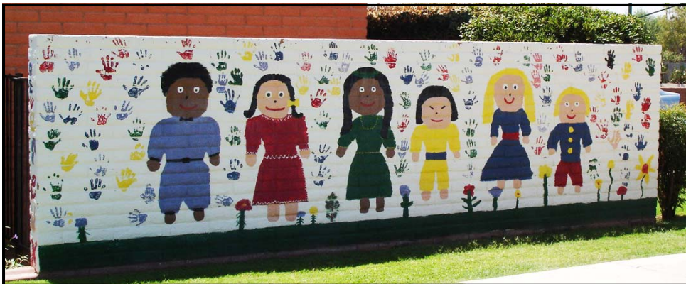
Above: A bright and cheery mural outside the Center.

“ In the end we will remember not the words of our enemies, but the silence of our friends. ”