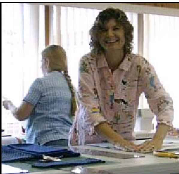
All photos: Hmm... I'm noticing a theme throughout all the photos on this page... everybody's smiling!

I'll go out on a limb here (pun intended) and guess that camp was cool and fun!