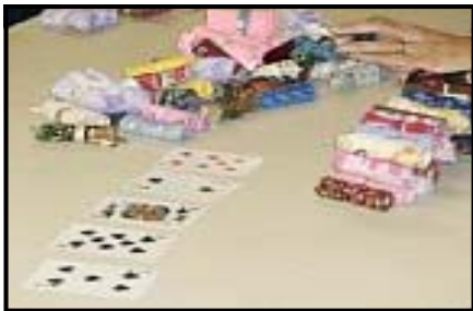
Below: These ladies play for piles of our most treasured currency... fabric!!!