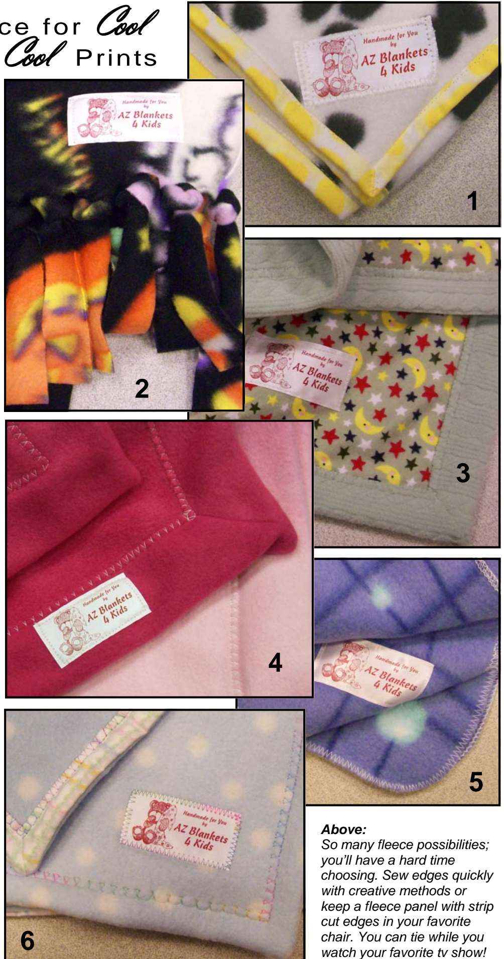
Above: So many fleece possibilities; you'll have a hard time choosing. Sew edges quickly with creative methods or keep a fleece panel with strip cut edges in your favorite chair. You can tie while you watch your favorite tv show!